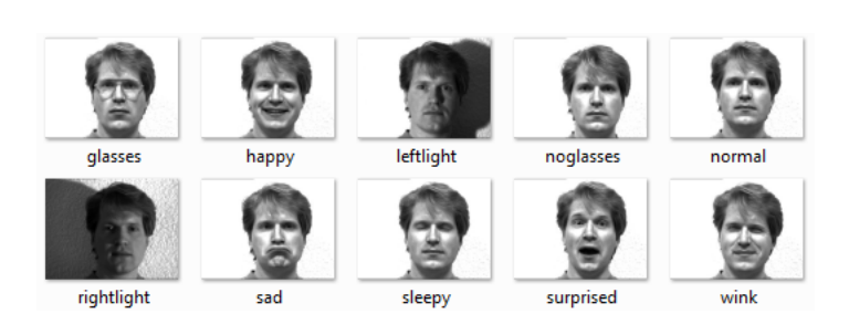
Fig. 1: different facial images for the same person.

images of 15 individuals. There are 11 images per subject, one per different facial expression or configuration: center-light, w/glasses, happy, left-light, w/no glasses, normal, right-light, sad, sleepy, surprised, and wink, [2], see fig.1.